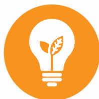
Supporting Environment Innovation

The product or service capable of commercial exploitation and scalability will be considered for the Awards.