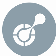
Business Process Innovation